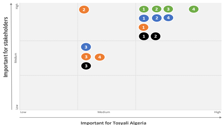
Tosyali Algeria Materiality Matrix